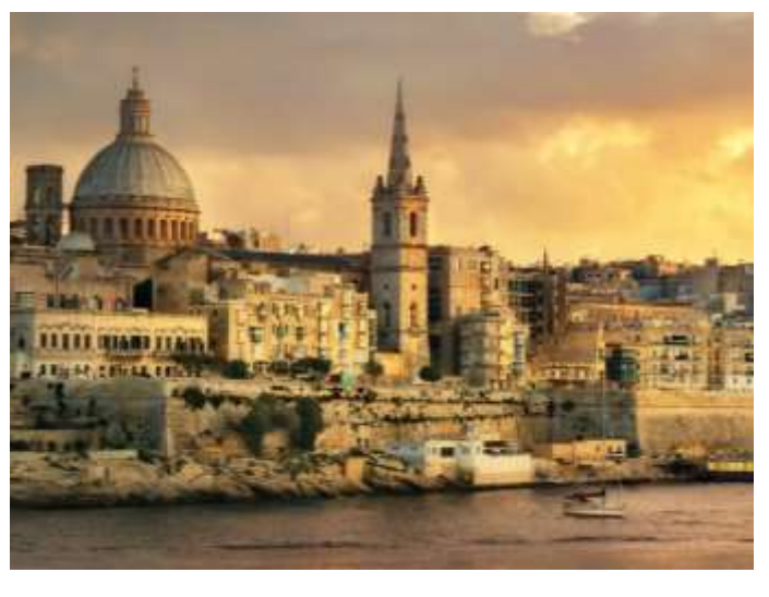
Valletta ghost tour