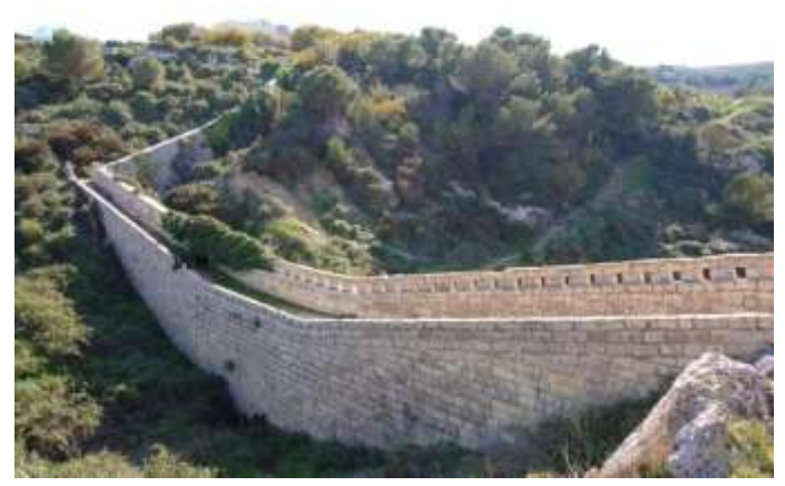
Victoria Lines: Malta's great wall of China

€ 48 per person Includes transport in Malta & Gozo and speedboat to Comino