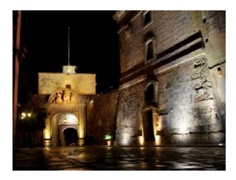
Mdina by night